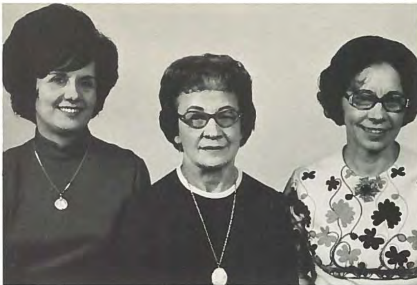
ST. ANNE SODALITY OFFICERS