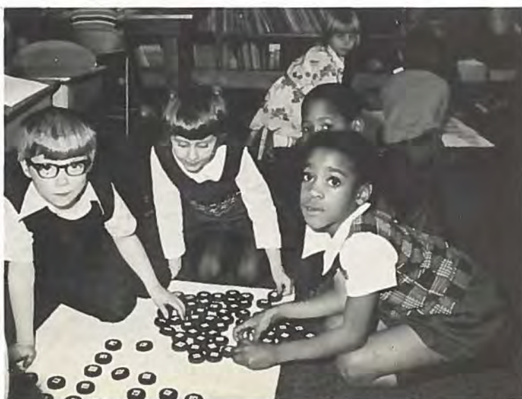
LEARNING THROUGH ACTIVITY