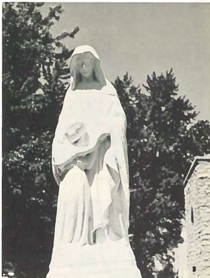
PATRONESS OF OUR PARISH