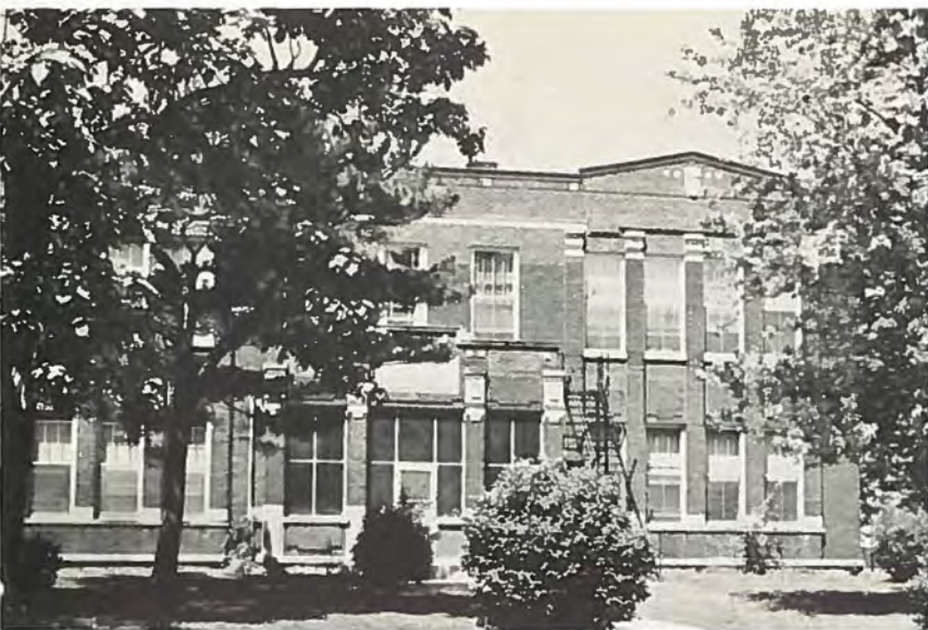
ST. ANNE ACADEMY