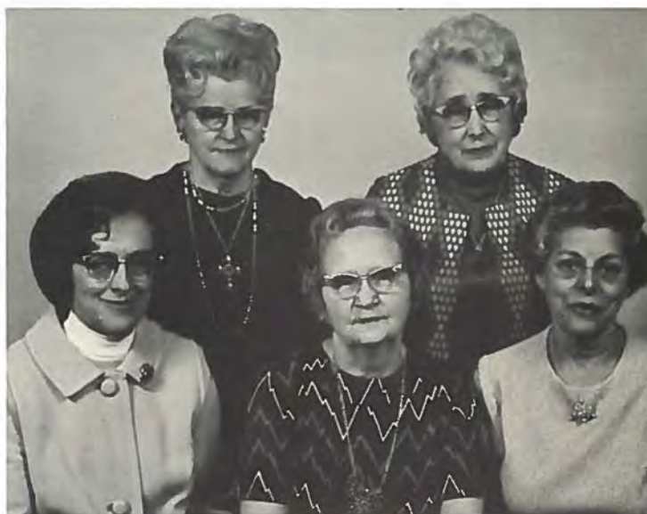
LEGION OF MARY