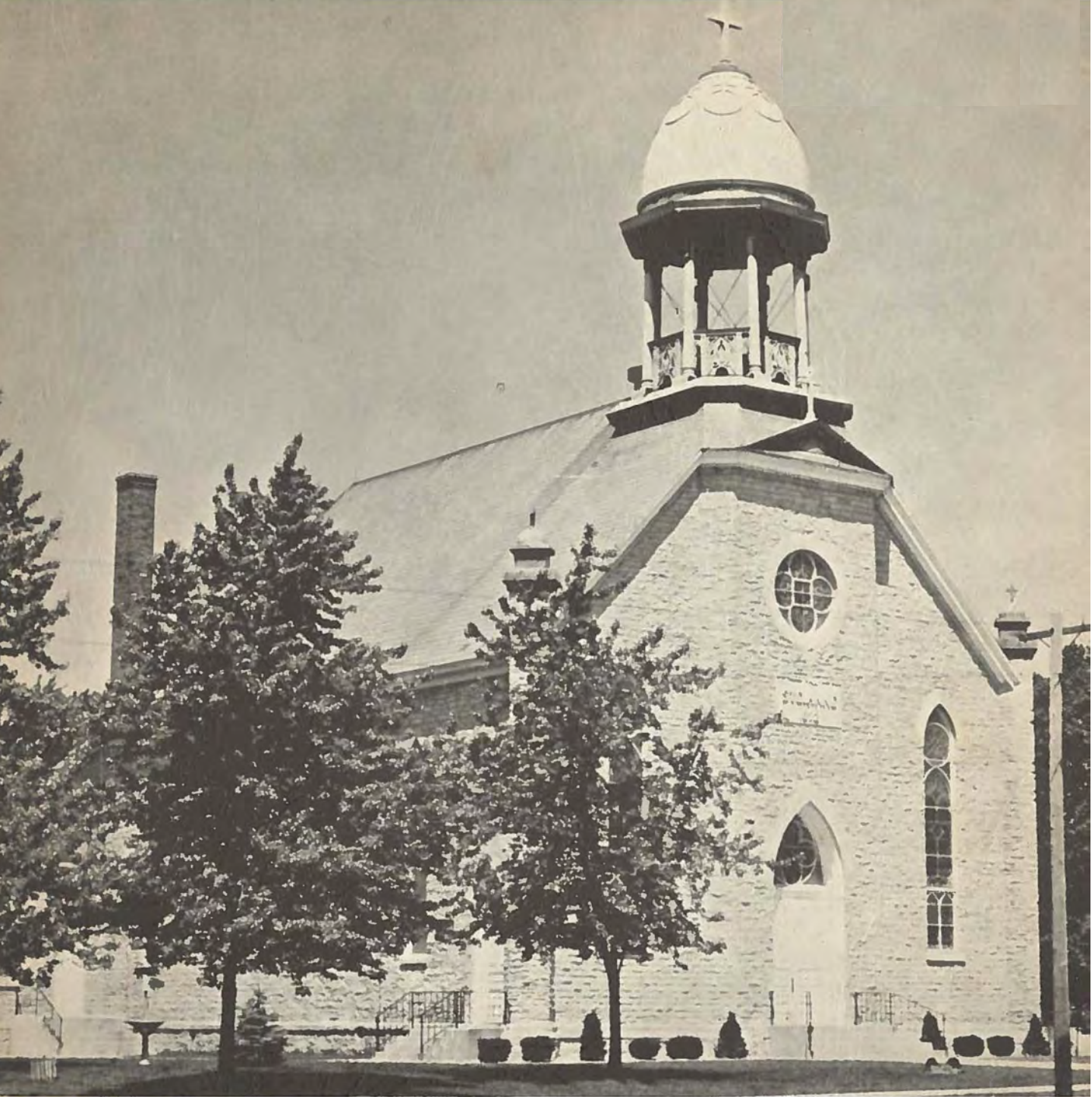
SAINT ANNE CHURCH SAINT ANNE, ILLINOIS