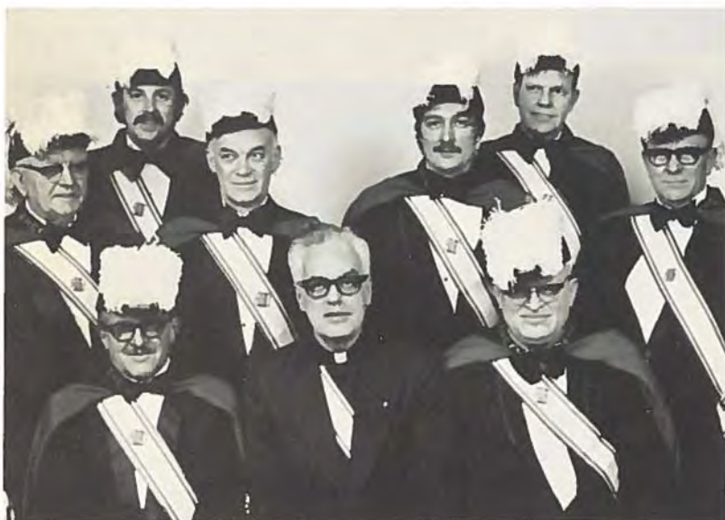
KNIGHTS OF COLUMBUS COUNCIL No. 5081