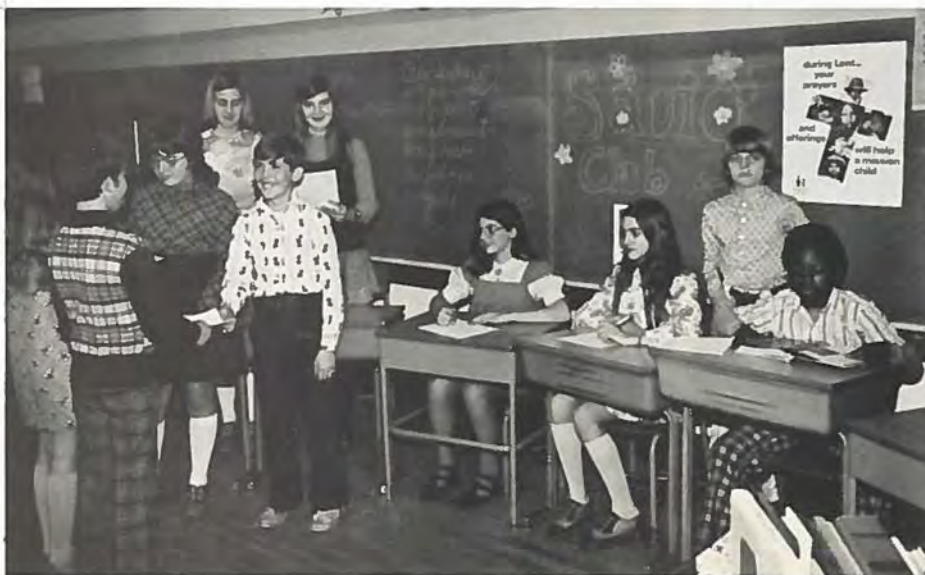
SAVIO CLUB MEETING