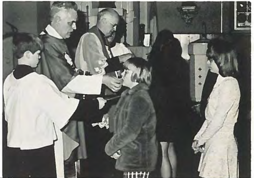
RECEIVING HOLY COMMUNION