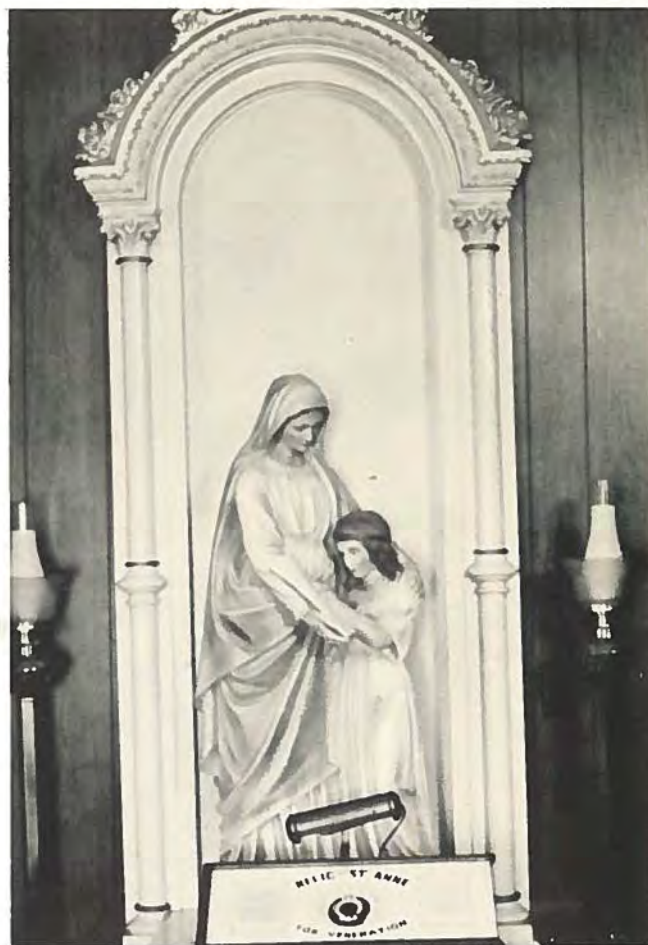
SHRINE OF ST. ANNE