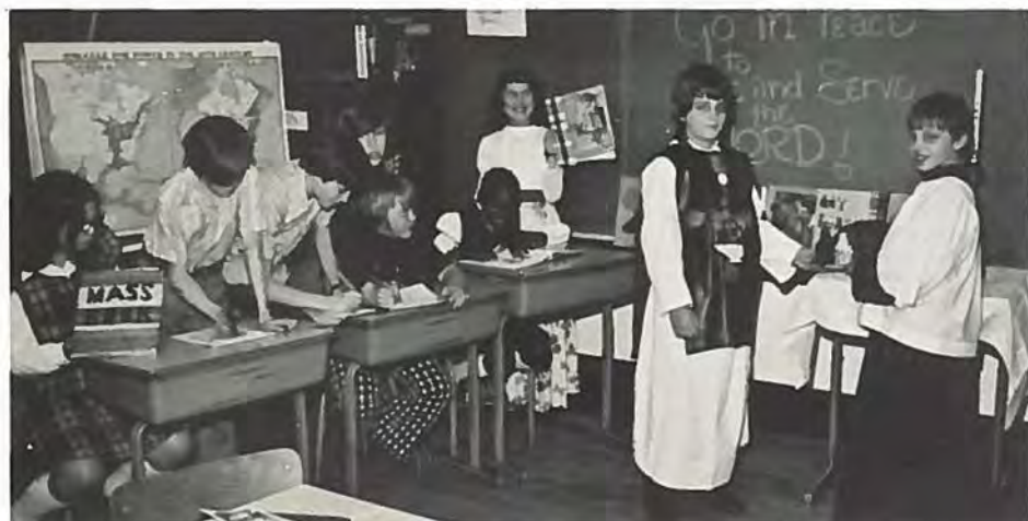
STUDYING THE MASS