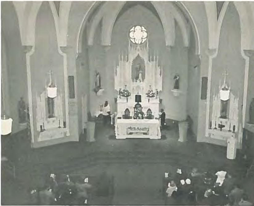
INTERIOR OF CHURCH