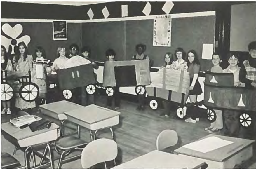
DRAMATIZATION IS FUN