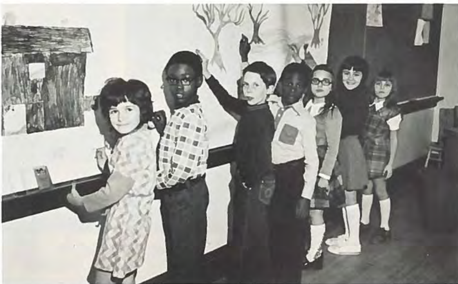
ARTIST AT WORK